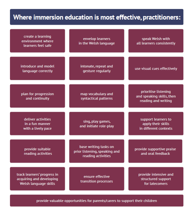
Figure 5.Graphic as static image with long description

The main features of effective language immersion are relevant to both early and late immersion provision. Although the context and age of learners are different, effective immersion education principles are consistent. For example, effective practitioners create a safe learning environment that envelops learners in the Welsh language. They prioritise listening, speaking, reading, and writing skills in that order, with a clear emphasis placed on developing learners' oral skills. They introduce and model language correctly for learners, and intonate, repeat and gesture regularly to support them.