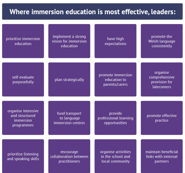
Figure 5.Graphic as static image with long description

Most local authorities have appropriate plans to strengthen their provision for the Welsh language, with many referring specifically to immersion education. The majority of officers speak enthusiastically about their proposed plans to strengthen the Welsh language in education, for example when describing the content of their draft Welsh in Education Strategic Plans (WESP) and the planned use of the COVID-19 recovery funding that is available to support late immersion. However, it is too early to report comprehensively on the plans and their effect. In the cases where they provide a strong vision for the use of immersion education, this refers mainly to strengthening early immersion processes, which are already robust, expanding Welsh-medium provision in the non-maintained and primary sectors, or establishing language immersion centres to support latecomers. Where authorities are planning to establish new language immersion centres, on the whole, the arrangements are at a very early stage. A budget from the Welsh Government to support Welsh in education is allocated to authorities as part of the Education Improvement Grant.